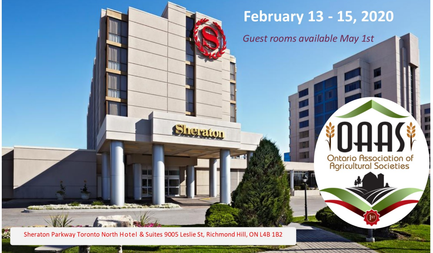
Sheraton Parkway Toronto North Hotel & Suites 9005 Leslie St, Richmond Hill, ON L4B 1B2